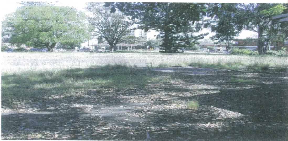
Forster Local Aboriginal Land Council. Aboriginal Heritage Assessment. Corner Lake & Middle Streets, Forster.